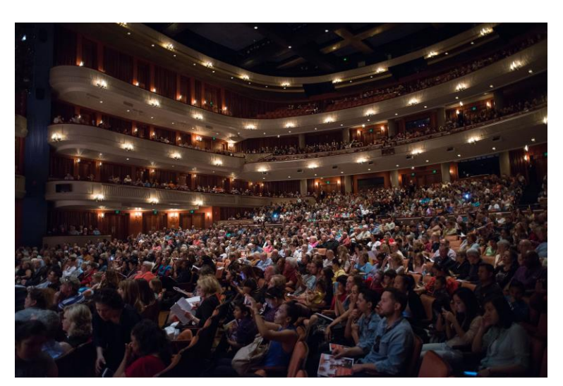
VocalEssence ¡Cantaré! Concert, 2015; Photo: Bruce Silcox

Most significantly, the two indicators of Social Bridging and Social Bonding outcomes were found to move together. Programs that trigger one tend to trigger the