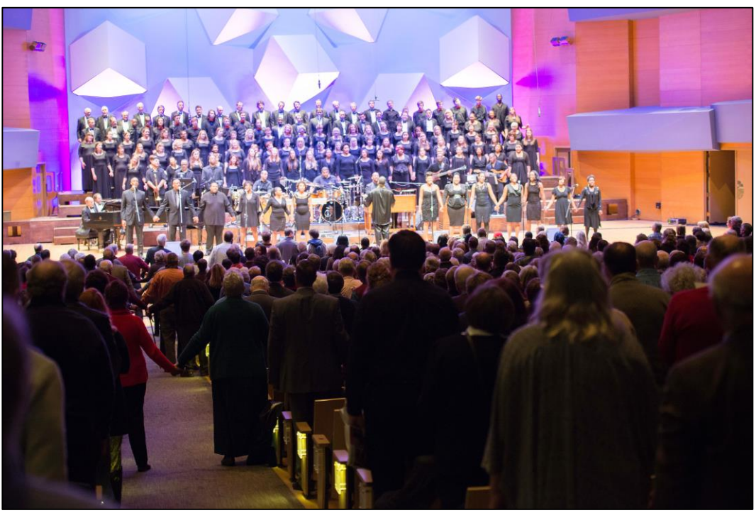
VocalEssence WITNESS-Let Freedom Ring 2015; Photo: Bruce Silcox

Windy City Gay Chorus and Treble Quire (IL)