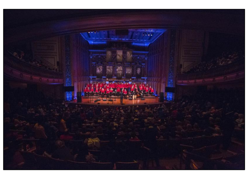
Boston Children's Chorus, 13<sup>th</sup> Annual Dr. Martin Luther King, Jr. Tribute Concert: Raw Truth

First-time attendees to a given chorus's programs are more likely than frequent attendees to cite social motivations, especially "because someone invited you" and